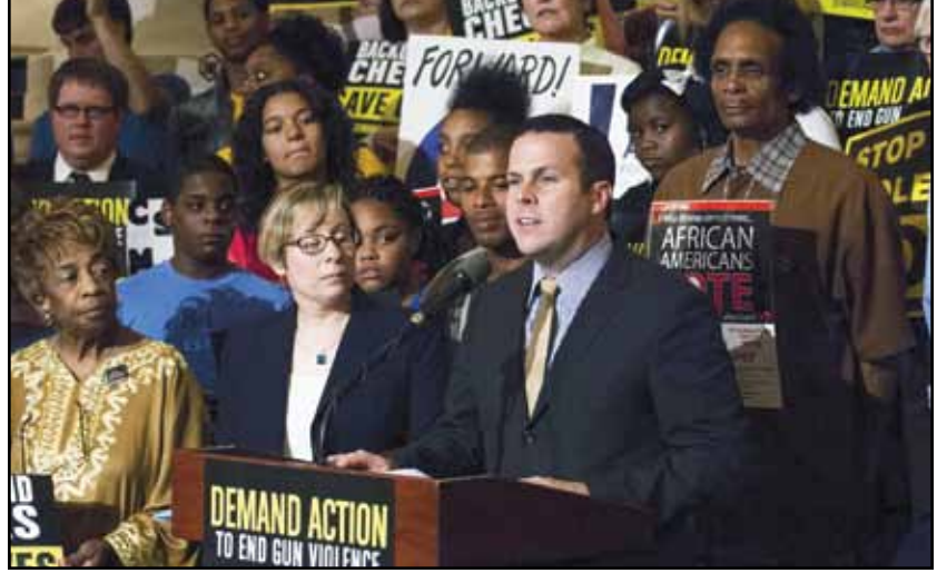
Rep. Boyle speaks at a rally in Harrisburg for reasonable gun safety legislation, which includes his bill to prohibit the sale of large capacity ammunition magazines.